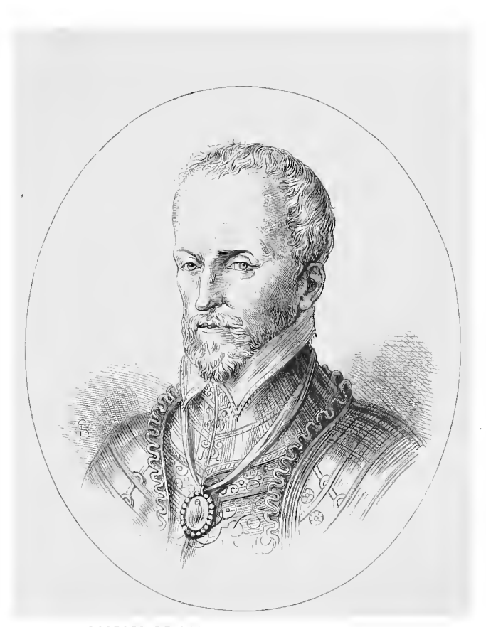
GASPARD DE COLIGNY, ADMIRAL OF FRANCE.